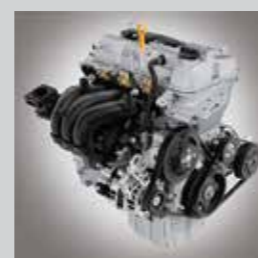
K-Series Fuel Efficient Engine