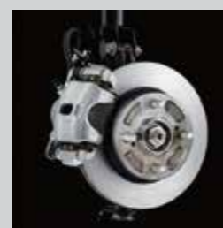
ABS Brakes with EBD